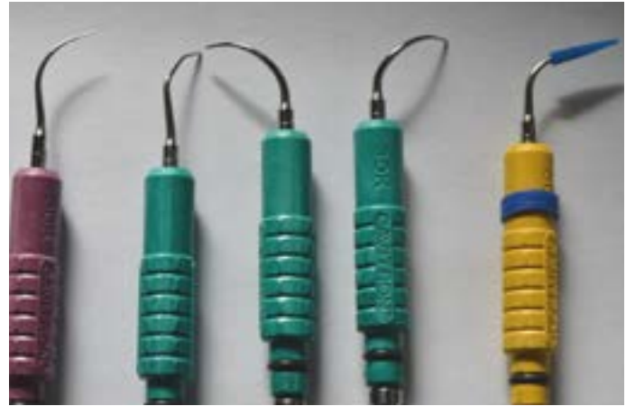
▲ Insert selection for case study

Accomplishing ultrasonic debridement successfully from start to finish requires a complement of strategically selected, sequenced, and adapted instruments. A dental hygienist would not use only one hand instrument to complete a whole mouth so why would dental hygiene