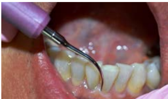
▲ THINsert with probe-like subgingival insertion