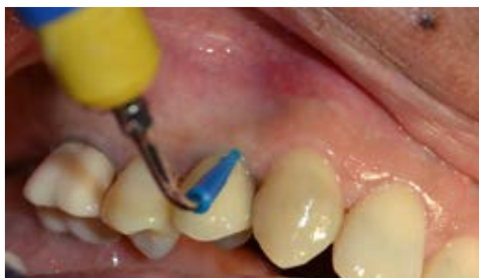
▲ SofTip™ implant insert on 1.4

varying power levels. Disruption of biofilm on the slightly inflamed 1.4 implant was completed with the SofTip™ implant insert.