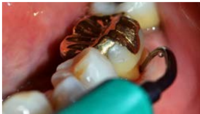
▲ slimLINE left for Class III furcation on tooth 3.6

The ultra-slim insert (THINsert) using curette positioning was chosen for deposit removal in tight contact and interproximal areas. With hand instrumentation, the curette and sickle scaler often prove too thick to access tight tooth and gingival tissue. Given its diversity, the ultra-thin insert can be introduced subgingivally on a lower power setting for light deposit and biofilm removal in constrictive tissue areas. The slightly wider diameter and triple bend of the slimLINE 1000 allows for more surface area coverage and better adaptation around line angles with the versatility of